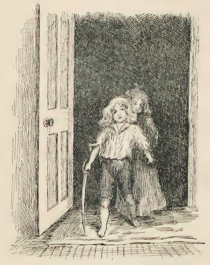
HE MADE A PRETTY PICTURE-ALERT AND QUITE FEARLESS.